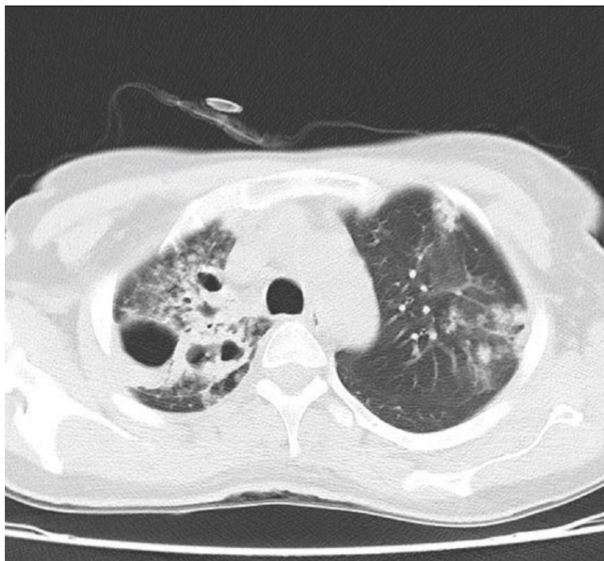
Fig. 1: Chest CT-scan of the first case suggestive of TB and superinfection of COVID-19 or influenza viral pneumonia